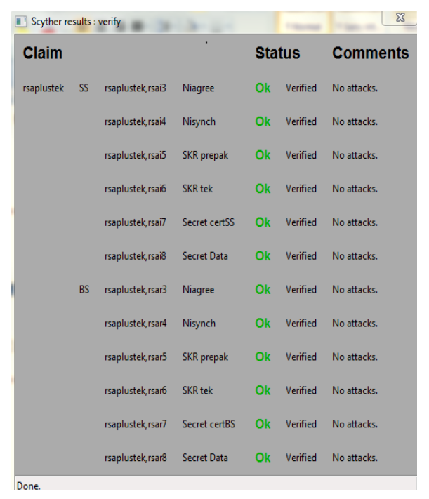
A- Analyses formal of New PKM